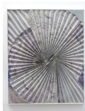
4 Letha Wilson, Nevada Concrete Folds , 2015.