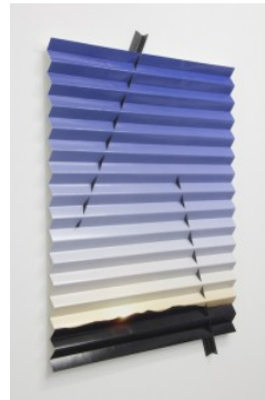
3 Letha Wilson, Nevada Sunrise Wall Sundial (Two Lines) , 2015.